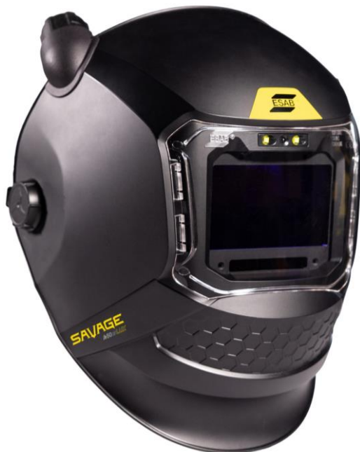
SAVAGE A50 Air LUX